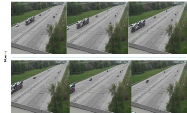
Figure 1. From top left to bottom right, all the cars shown are in normal driving positions.

split the dataset into 80% for training, and 20% for validation. Table.1 shows the number and percentage of frames of the training and testing sets. Figure 1 shows sample frames of normal driving from the AI City Challenge dataset. Each