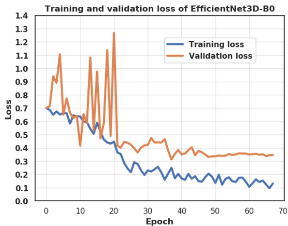
Figure 4. Training and validation loss of EfficientNet3D-B0.