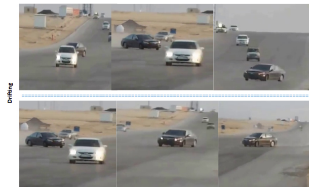
Figure 2. From top left to bottom right the black car shows different positions of drifting.

frame has a size of 640x360. We pre-processed all frames to make them suitable for input size 112x112 for the EfficientNet feature extractor. This dataset will be made open-source to drive new research on car drifting detection so that it can effectively contribute to AI City challenges to increase human safety and mitigate the risks of aggressive driving behavior. Figure 2 shows sample frames of the aggressive driving car from the anomaly dataset.