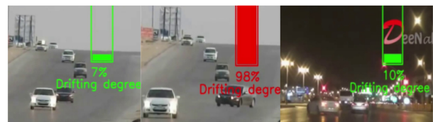
Figure 6. Output of the proposed architecture.